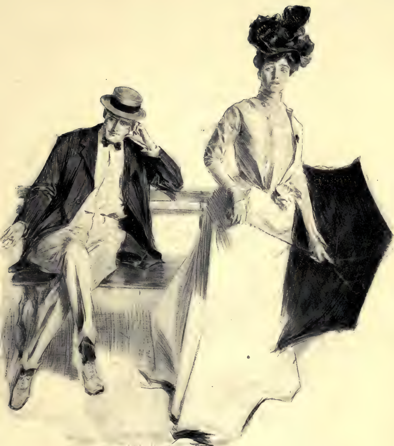
— Grand Costume Christy 1899